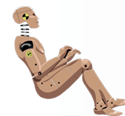
CRASH TEST DUMMY SURVEY