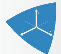
COORDINATE SYSTEM TRANSFORMATION